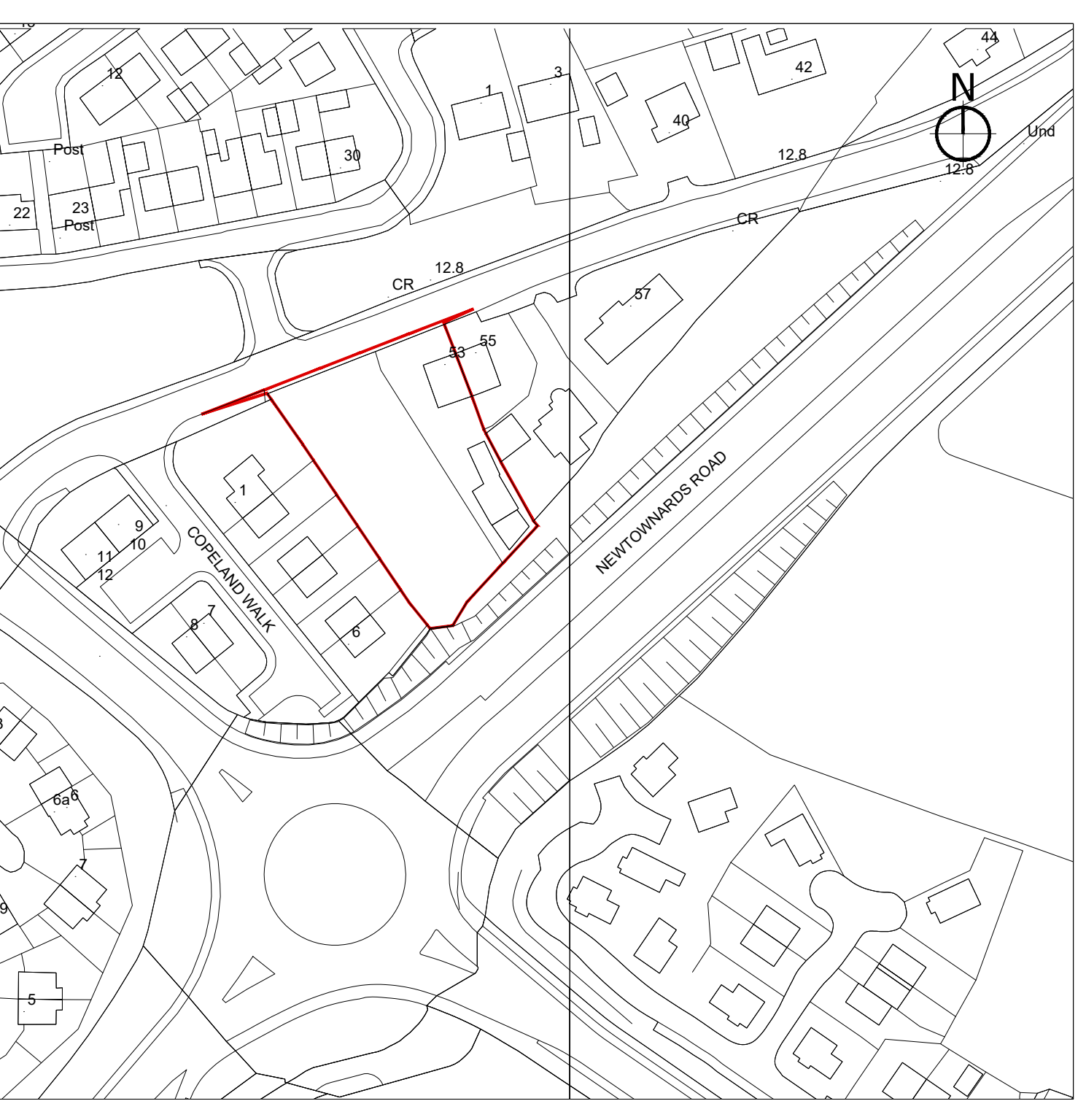
site location map / 1:1250