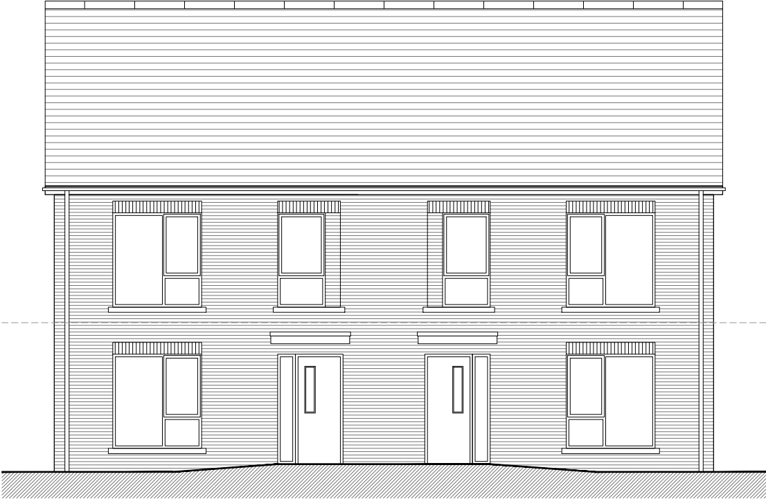
FRONT ELEVATION HTB BRICK FRONT ELEVATION HTB1 BRICK