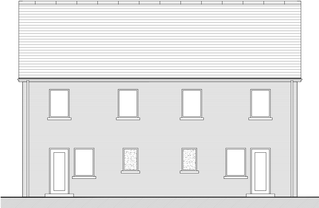
REAR ELEVATION HTB1 BRICK REAR ELEVATION HTB BRICK