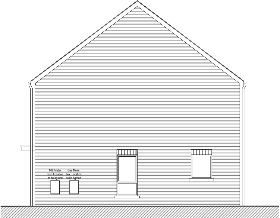
SIDE ELEVATION HTB1 BRICK