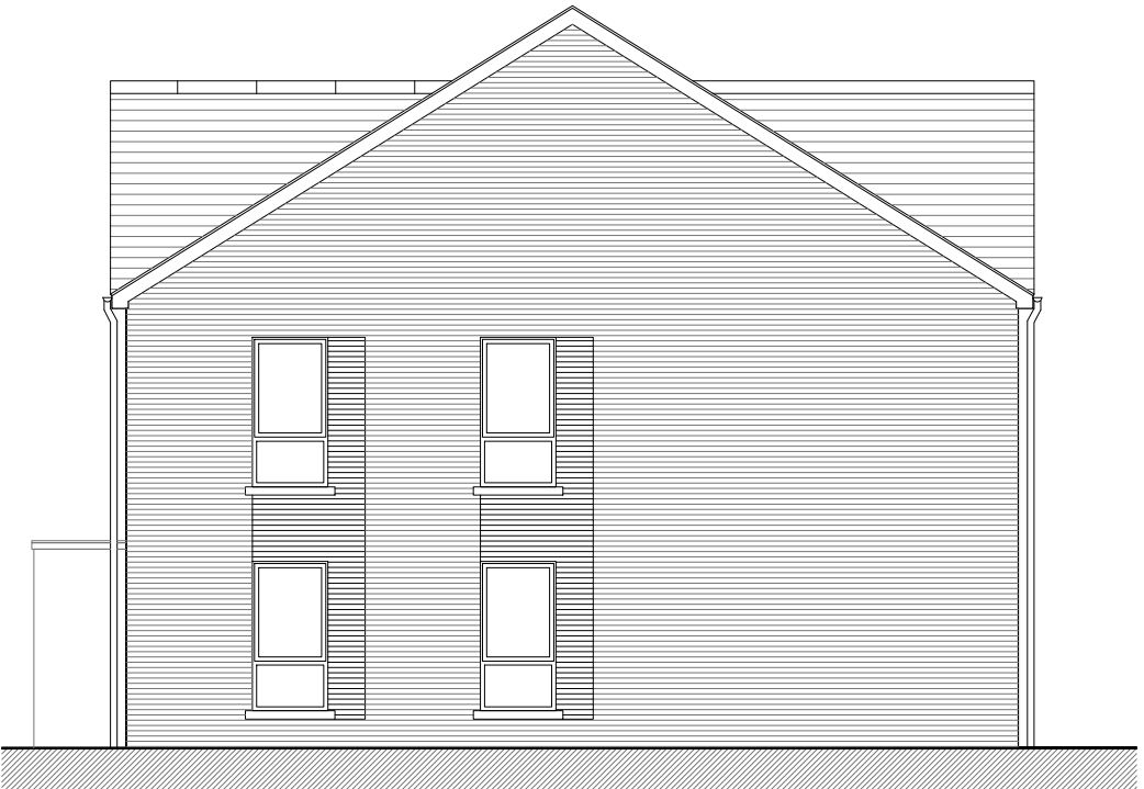
SIDE ELEVATION APARTMENT BRICK