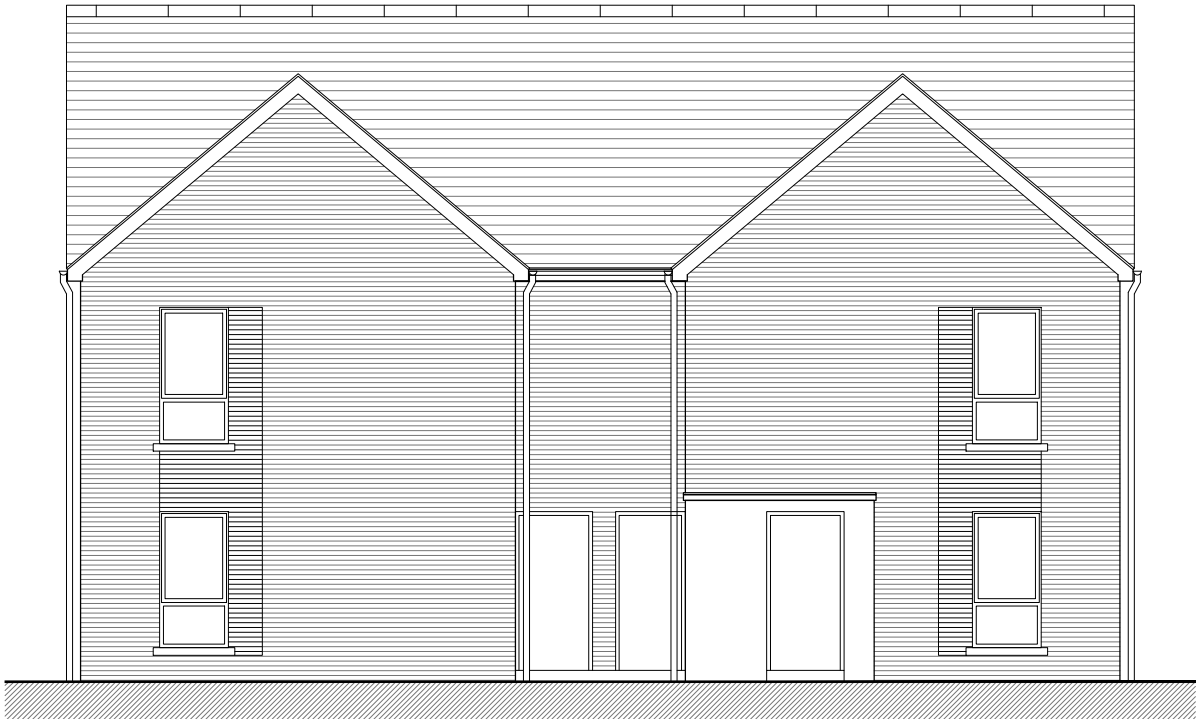
REAR ELEVATION APARTMENT BRICK