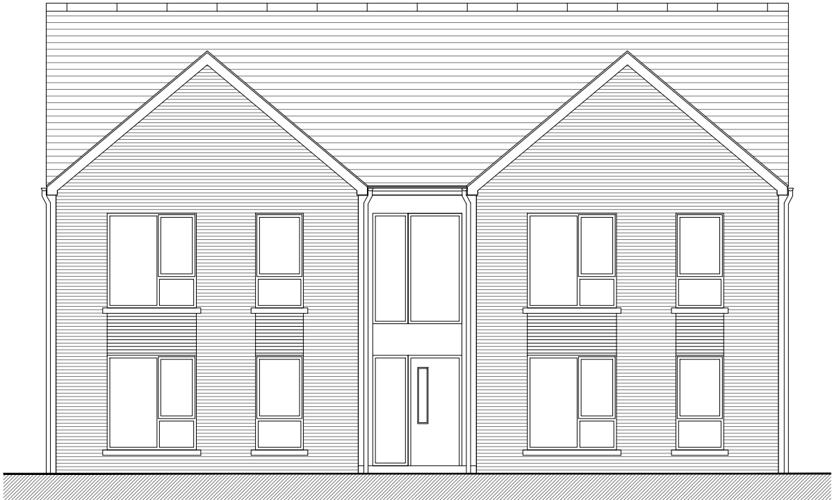
FRONT ELEVATION APARTMENT BRICK