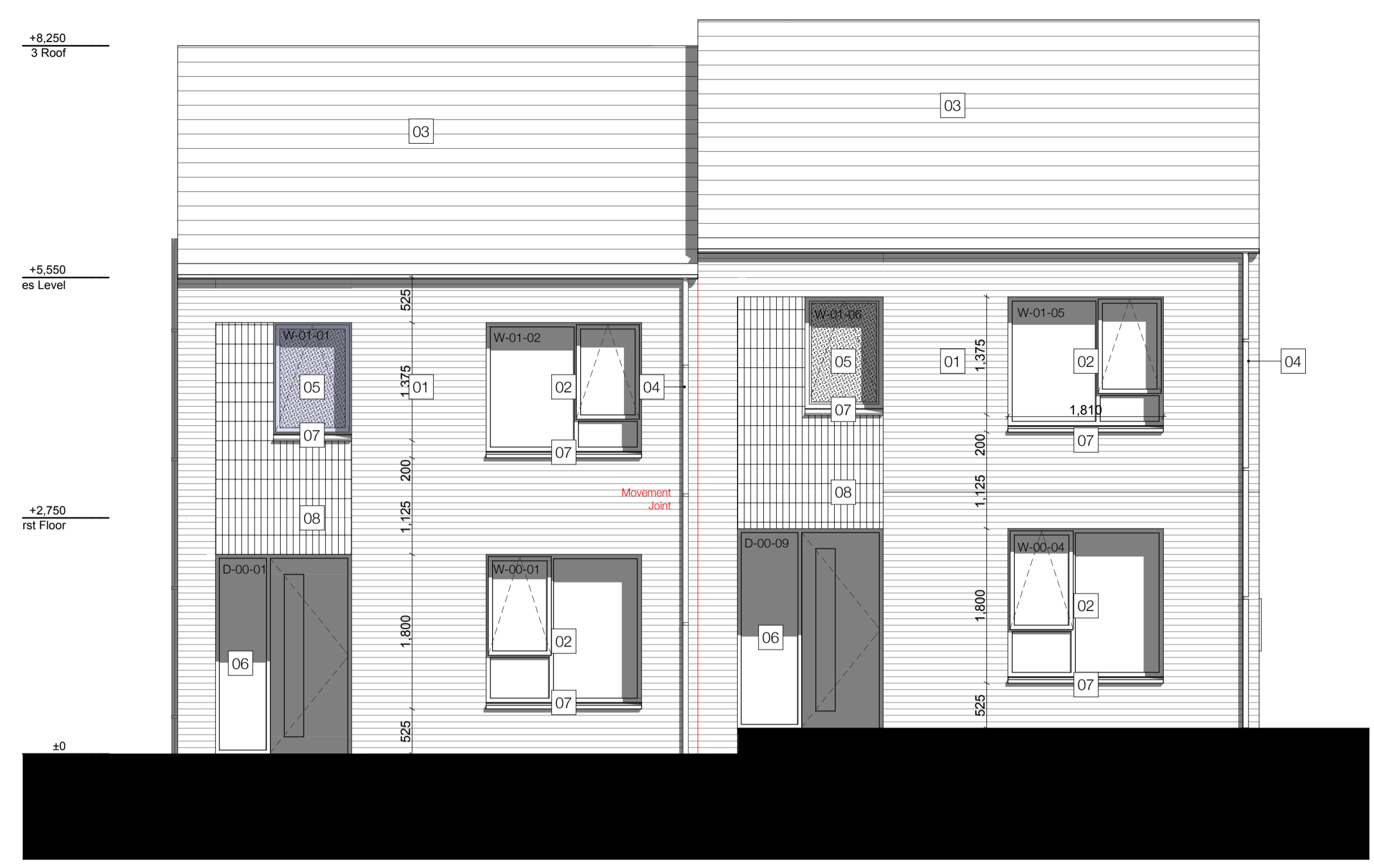
Front Elevation E-01 1:50

NOTES Check all dimensions on site. Do not scale from this drawing. Report discrepancies and / or omissions to Hall Black Douglas. This drawing is project specific and confidential. No part is to be used or copied in any way without the express prior consent of Hall Black Douglas. Hall Black Douglas can accept no liability for content or accuracy of any information provided on this drawing which has been supplied by third party surveyors or consultants.