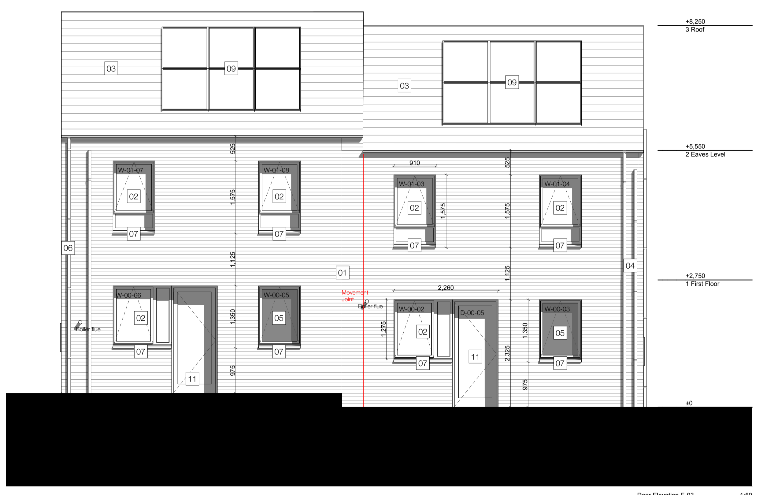
Rear Elevation E-03 1:50