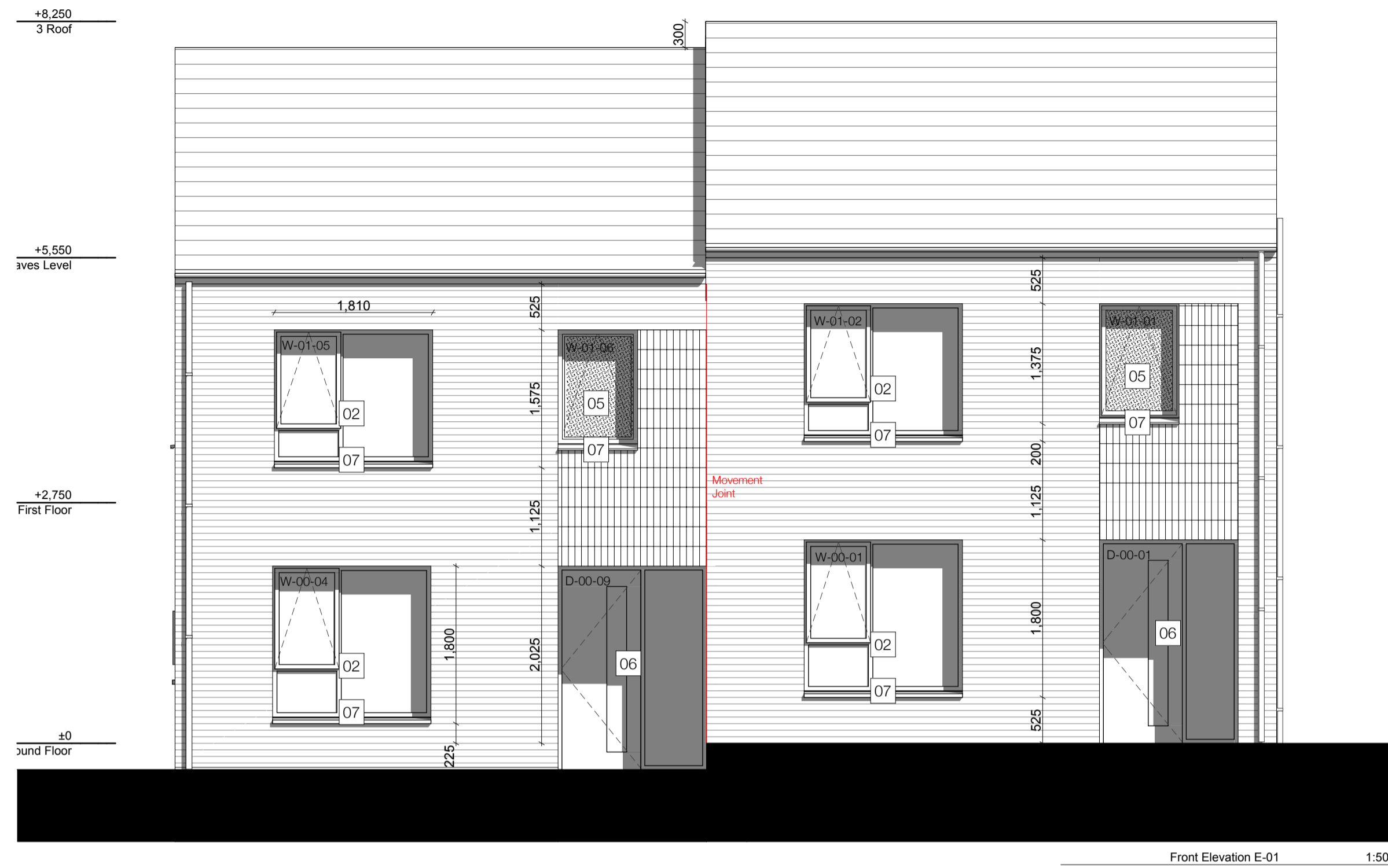
Front Elevation E-01 1:50

NOTES Check all dimensions on site. Do not scale from this drawing. Report discrepancies and / or omissions to Hall Black Douglas. This drawing is project specific and confidential. No part is to be used or copied in any way without the express prior consent of Hall Black Douglas. Hall Black Douglas can accept no liability for content or accuracy of any information provided on this drawing which has been supplied by third party surveyors or consultants. This drawing is copyright of Hall Black Douglas UK, see title panel for date of creation.