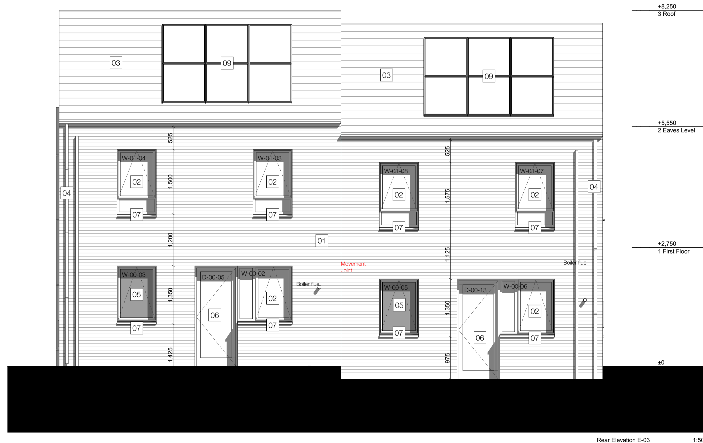
Rear Elevation E-03 1:50