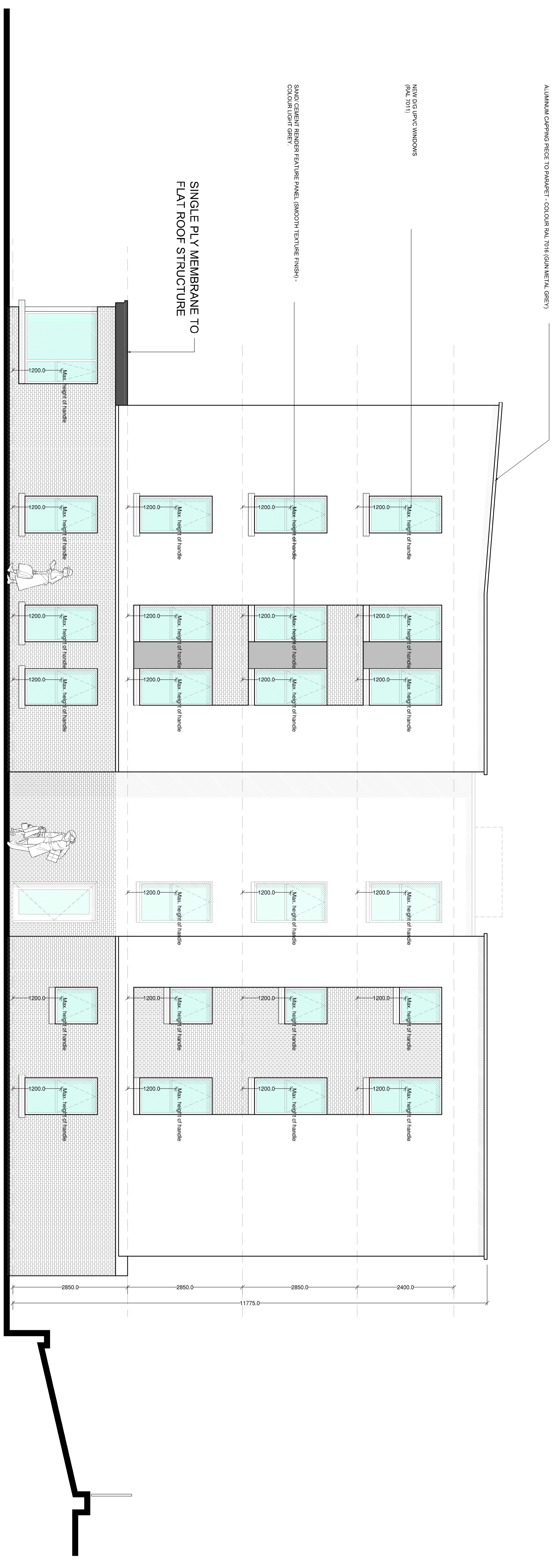
Block A Elevation 4 SCALE 1:25