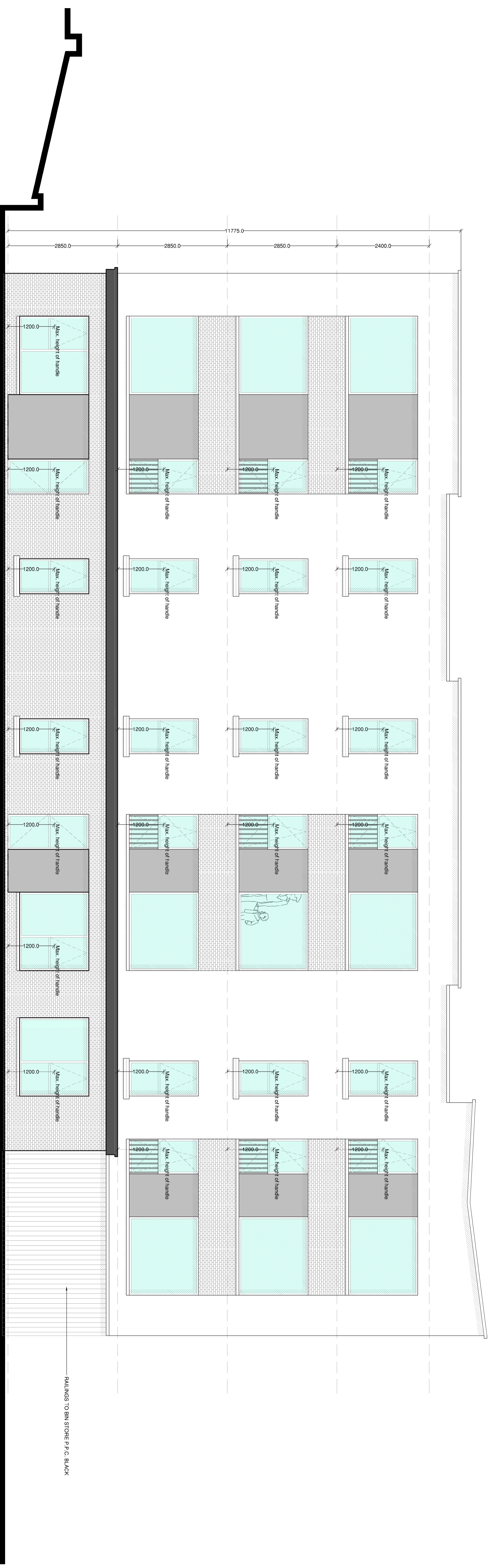
Block A Elevation 3 SCALE 1:25