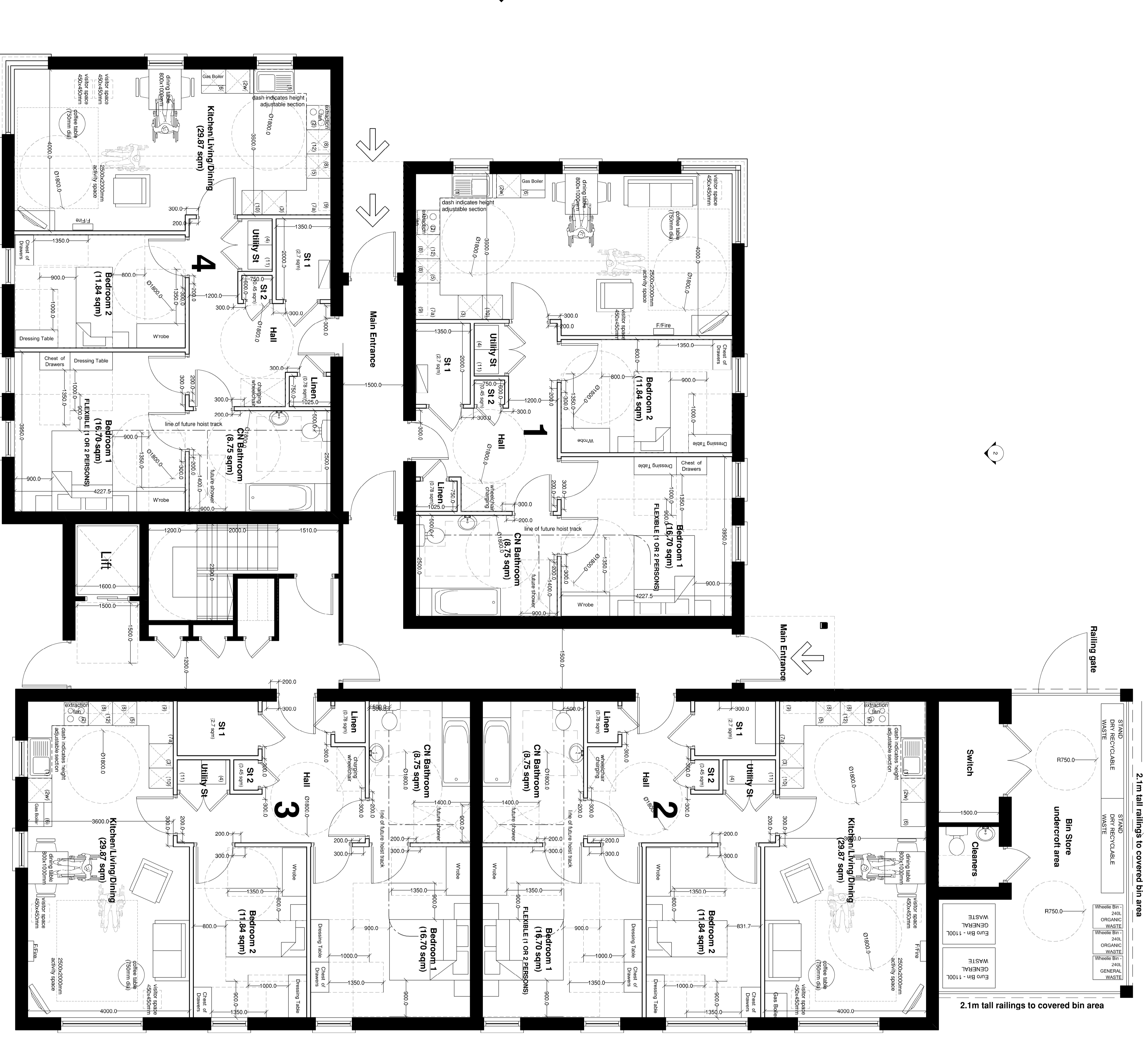
Block A Ground Floor Plan Scale: 1:50