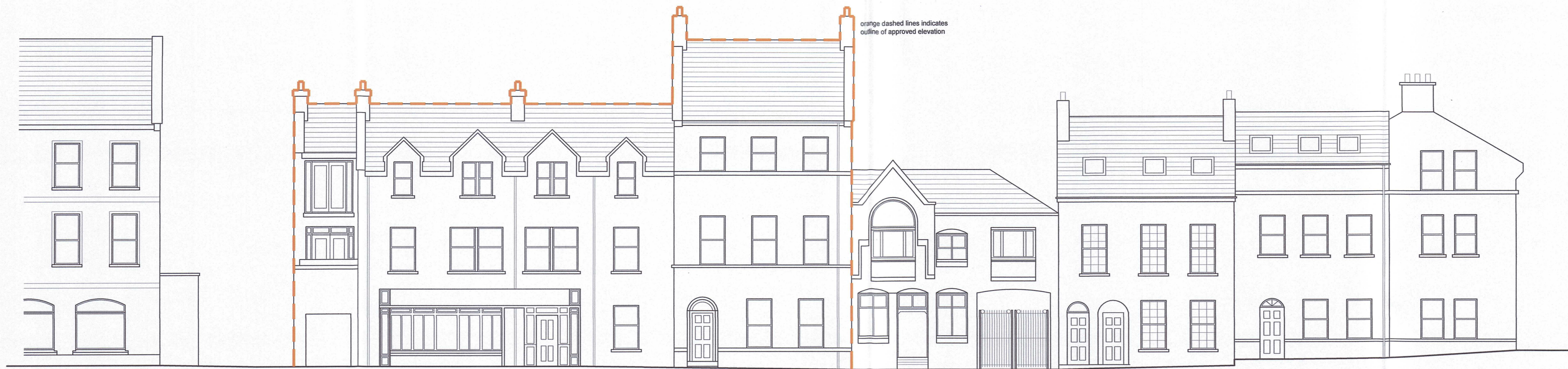
APPROVED FRONT ELEVATION - APPROVAL REF LA02/2015/0557/F