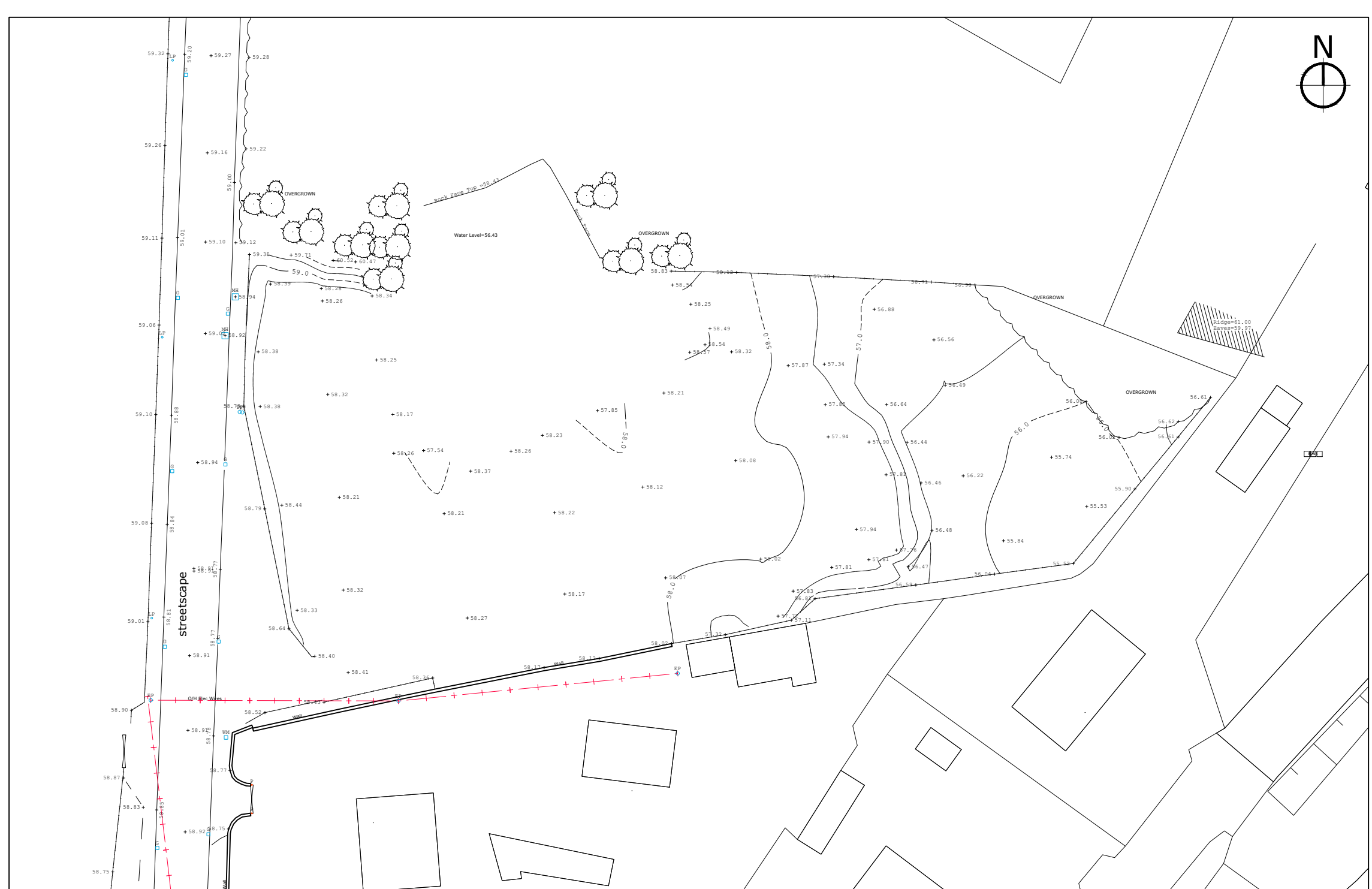
existing site layout 1:500