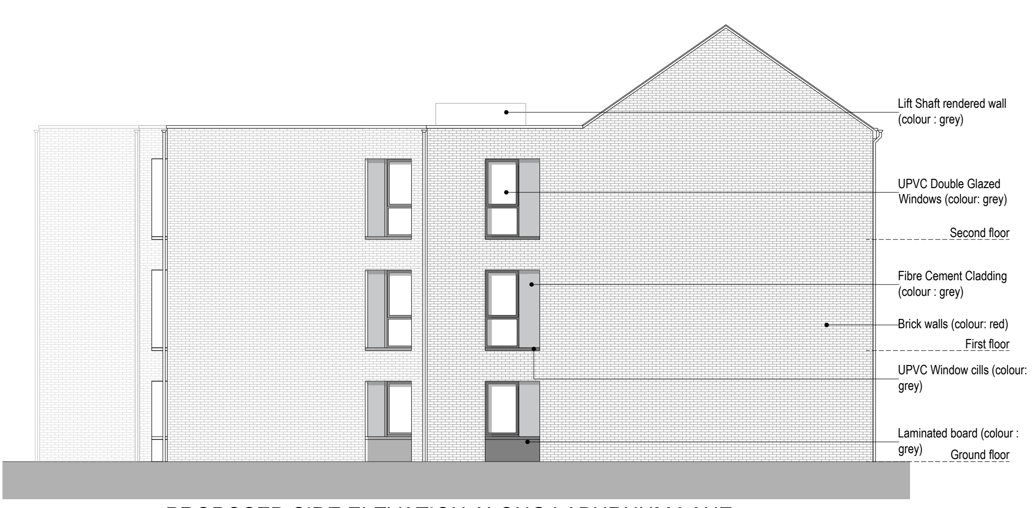
PROPOSED SIDE ELEVATION ALONG LABURNUM LANE