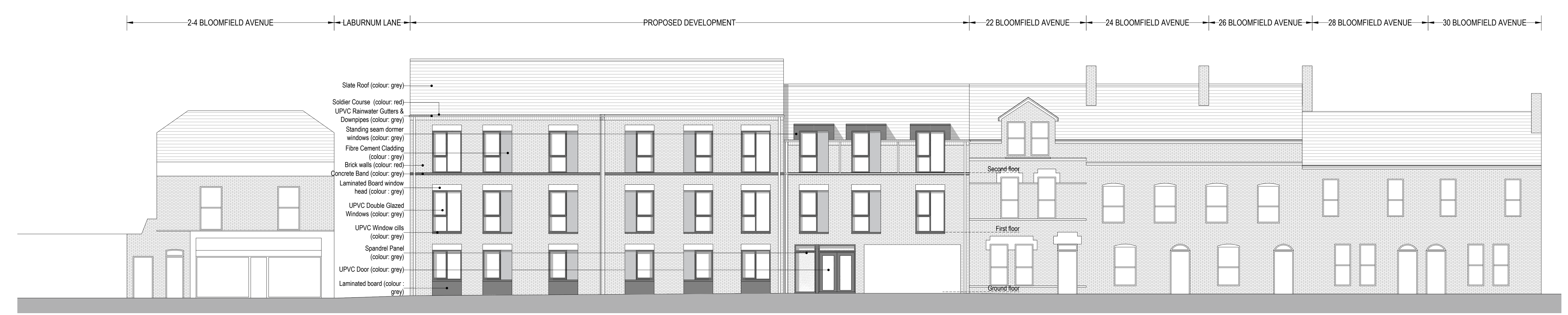
PROPOSED FRONT ELEVATION ALONG BLOOMFIELD AVENUE