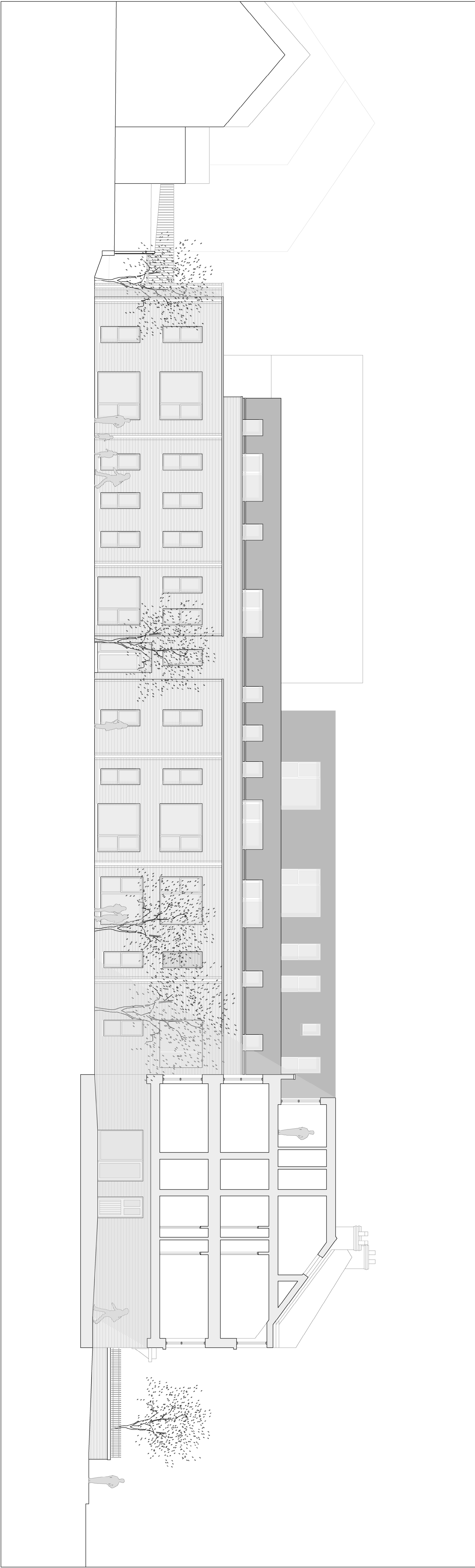
WEST ELEVATION (A-A)