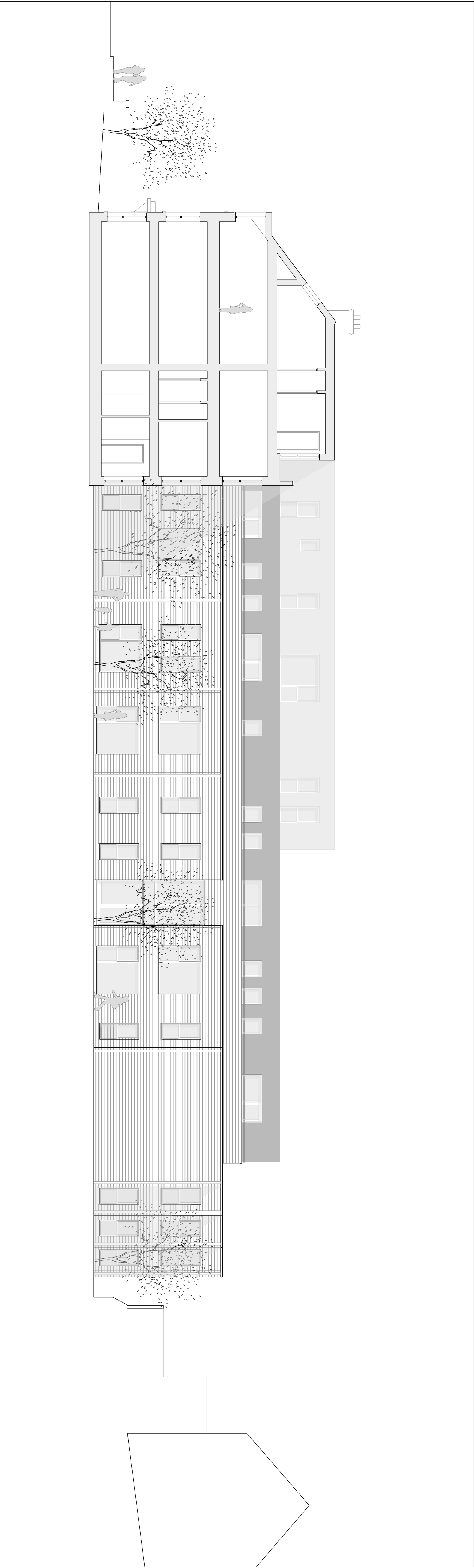
EAST ELEVATION (D-D)