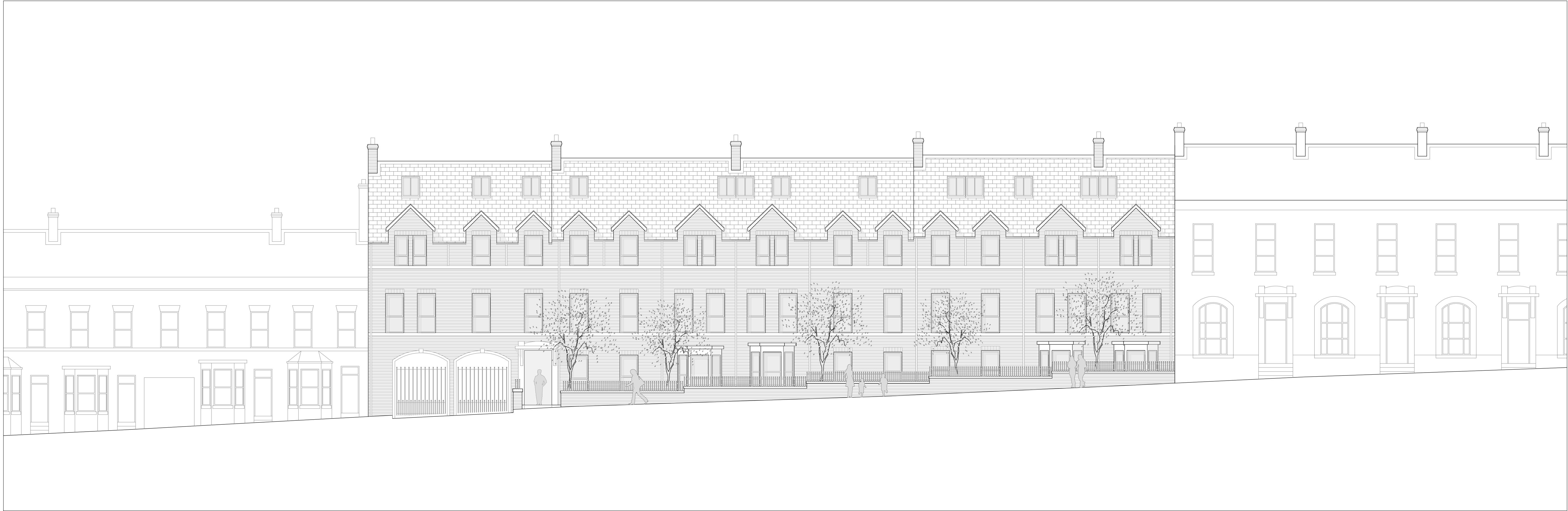
SOUTH ELEVATION - TATES AVENUE