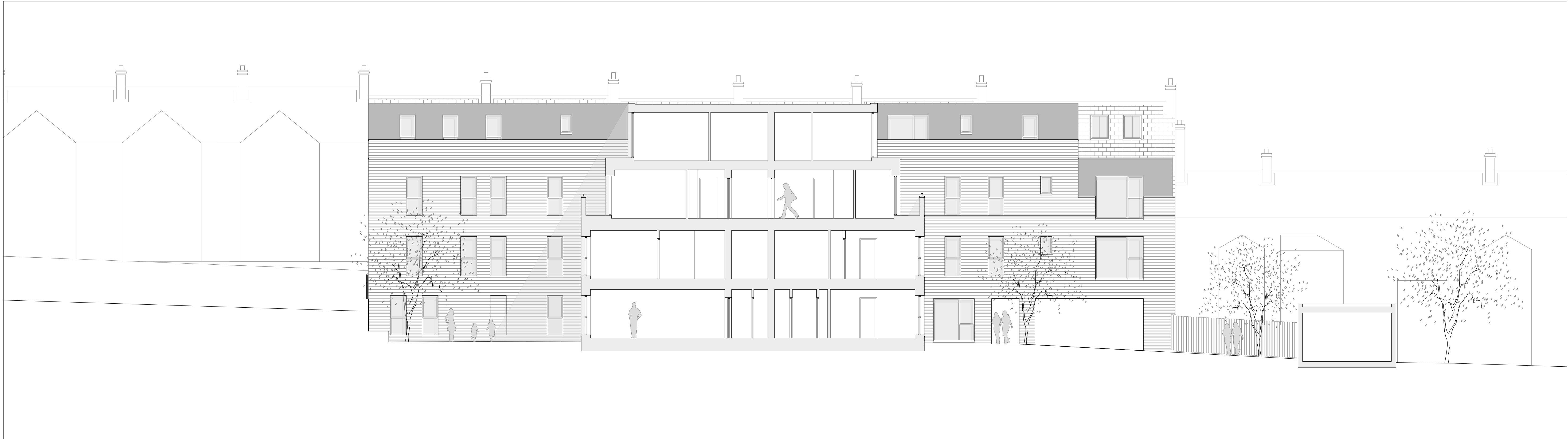
NORTH SECTIONAL ELEVATION (C-C)