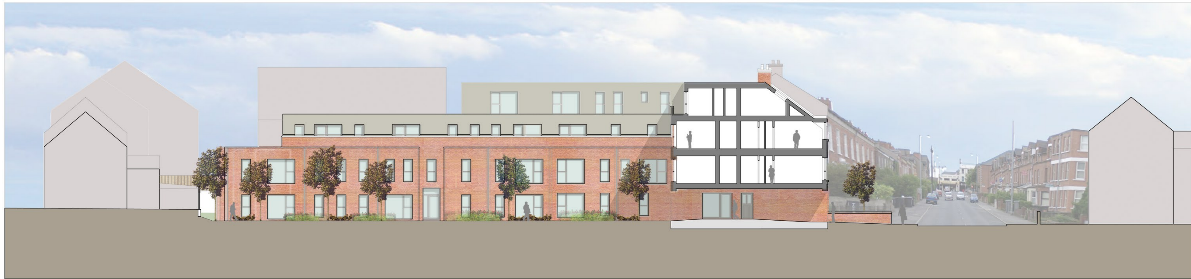
SITE SECTIONAL ELEVATION (A-A)