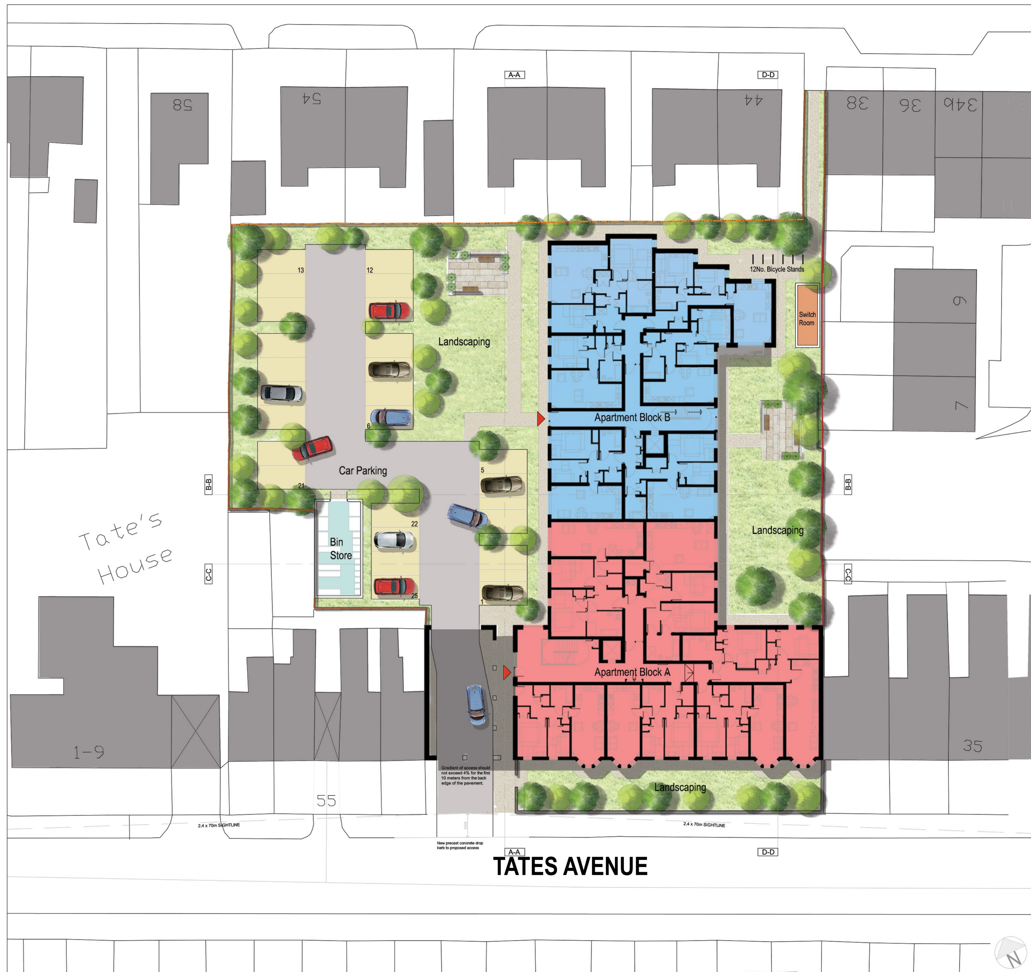
SITE LAYOUT PLAN